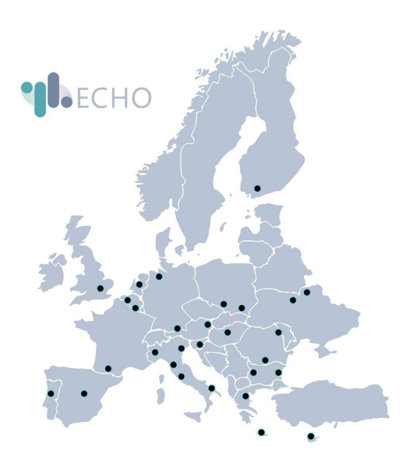
Figure 1: ECHO events' location